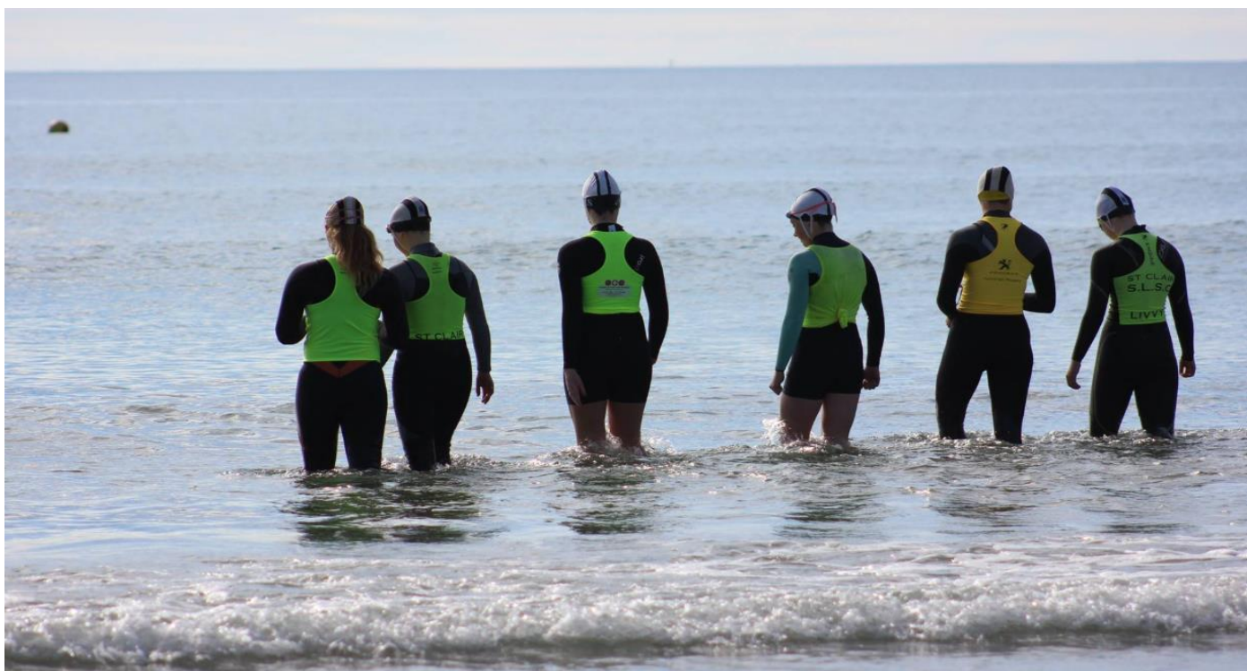
Senior Interclub one